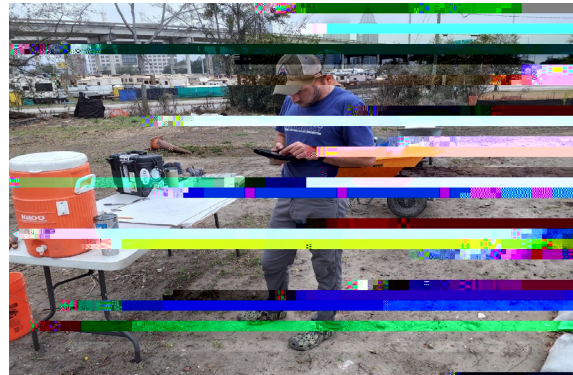
Emlid RTK system