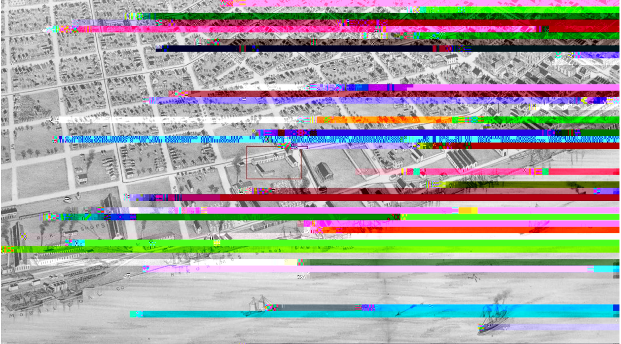
1891 Birdseye View map with the converted industrial structure converted to tenement building highlighted.

The Archivist of the Archdiocese has been contacted regarding any records associated with Louis Tickey (likely Louisa). More information on the pendant itself and the distribution of the pendant around the turn of the century will be sought in church records.