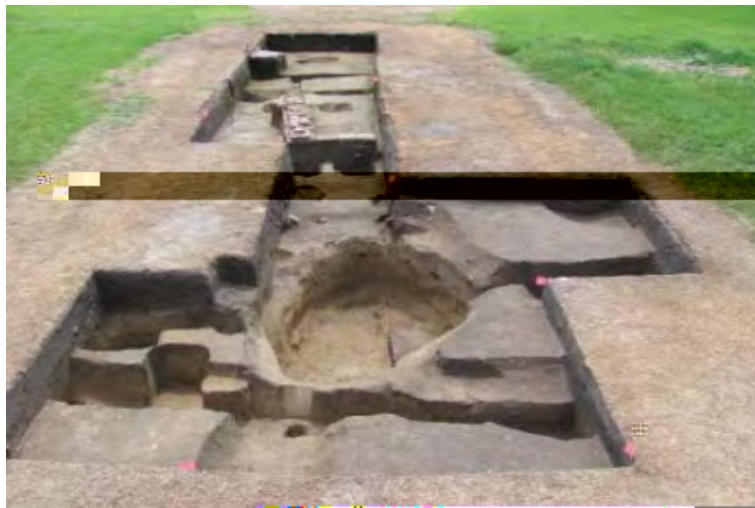
Excavated Feature 105 at La Pointe Krebs, another LDP, in planview (Gums and Waselkov 2015).