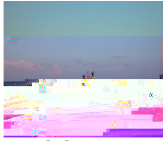
Oil Only Absorbent Booms